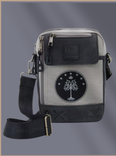
Our Universe The Lord Of The Rings Tree Of Gondor Crossbody Bag