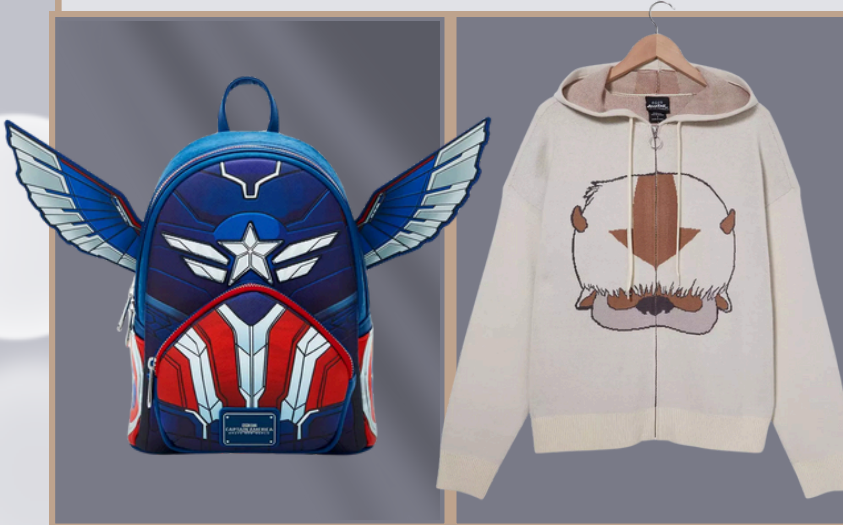
Loungefly Marvel Captain America: Brave New World Costume Mini Backpack

characters and fandoms in everyday outfits. Whether you're dressing up for a convention or simply incorporating bold details into your daily look, your style is fearless and fun. You don't shy away from experimenting with different costumes and looks—whether it's a hero's cape, a villain's statement piece, or your favorite anime hair color, you embrace your creativity with confidence. Cosplay Chic is for those who love to make a statement and express their artistic flair through their clothes.