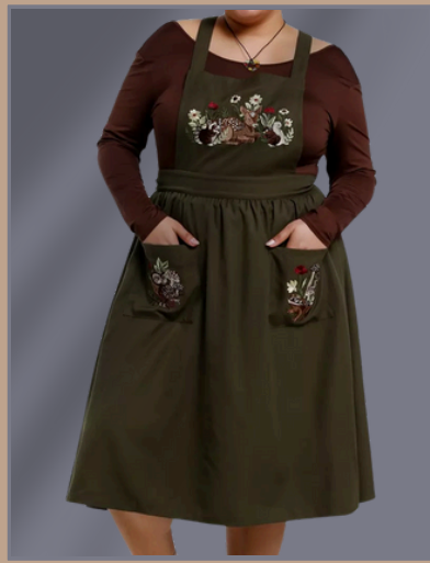
Thorn & Fable Woodland Embroidery Midaxi Skirtall Plus Size