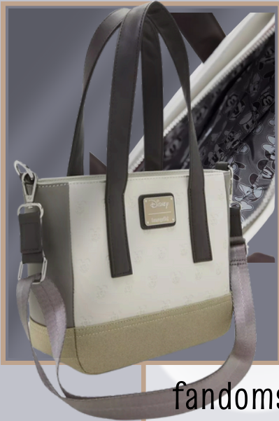
Loungefly Disney Mickey Mouse Neutral Tote Bag

If you prefer a more understated approach to expressing your geeky side, the Minimalist Geek style is your go-to. This chic look is defined by sleek, modern designs and subtle nods to your favorite fandoms. You're not about flashy prints or loud statements—instead, you appreciate the elegance of simplicity. Your wardrobe is full of versatile pieces that can be dressed up or down, allowing you to seamlessly integrate your love for geek culture with a minimalist aesthetic. Whether it's a sleek black jacket with a discreet logo or a simple graphic tee that only true fans will recognize, your style speaks volumes without saying too much.