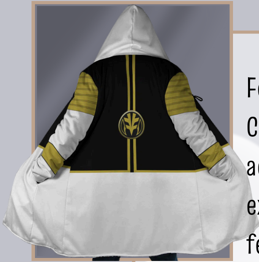
White Ranger Mighty Morphin Power Rangers Dream Cloak Coat

For those who live for transformation, Cosplay Chic is all about bold and adventurous fashion. Your wardrobe is an extension of your love for cosplay, featuring elements of your favorite