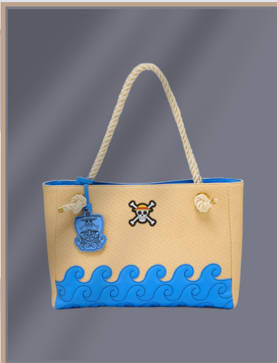
Loungefly One Piece Waves Textured Tote Bag, BoxLunch

If you find yourself constantly celebrating your favorite fandoms through your wardrobe, the Fandom Fashionista style is made for you! Your closet is a colorful tribute to the movies, TV shows, and books that have shaped your world. From Marvel and DC-inspired tees to anime-themed hoodies and accessories, your fashion choices are a way to express your love for the worlds you adore. Whether you're channeling your favorite characters with bold graphic tees or embracing a more minimalist vibe, you always find ways to incorporate fandom pride into your outfits. Sneakers, caps, and cozy hoodies with iconic symbols are your go-to pieces, but you're not afraid to give them a sleek, street-smart twist. You love showing off your geeky side in a trendy, urban way.