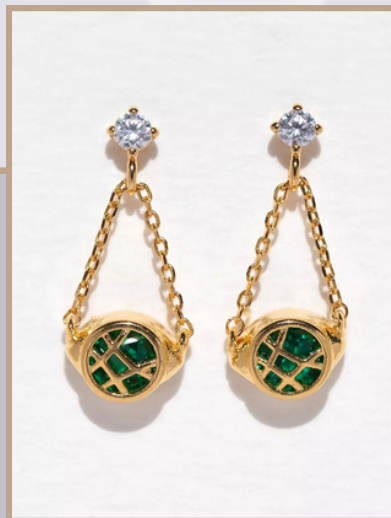
Marvel X Girls Crew Doctor Strange Eye Of Agamotto Drop Earrings

If you prefer a more understated approach to expressing your geeky side, the Minimalist Geek style is your go-to. This chic look is defined by sleek, modern designs and subtle nods to your favorite fandoms. You're not about flashy prints or loud statements—instead, you appreciate the elegance of simplicity. Your wardrobe is full of versatile pieces that can be dressed up or down, allowing you to seamlessly integrate your love for geek culture with a minimalist aesthetic. Whether it's a sleek black jacket with a discreet logo or a simple graphic tee that only true fans will recognize, your style speaks volumes without saying too much.