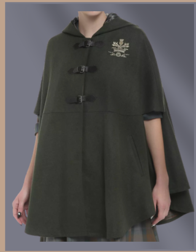
Her Universe Outlander Hooded Cape

If your heart belongs to epic fantasy worlds like Dungeons & Dragons, Lord of the Rings, or other magical realms, Fantasy-Chic might be your perfect style. Think earthy tones, cozy cloaks, and leather accessories, all paired with utility vests for that adventurer-inspired look. Whether you're trekking through the mountains or sipping tea by the fire, your style speaks to your inner explorer. This aesthetic may also appeal to fans of fairycore, blending nature-inspired elements with magical whimsy. Fantasy-Chic is for those who dream of a world filled with dragons, enchanted forests, and epic quests, and want to bring that spirit into their everyday wardrobe.