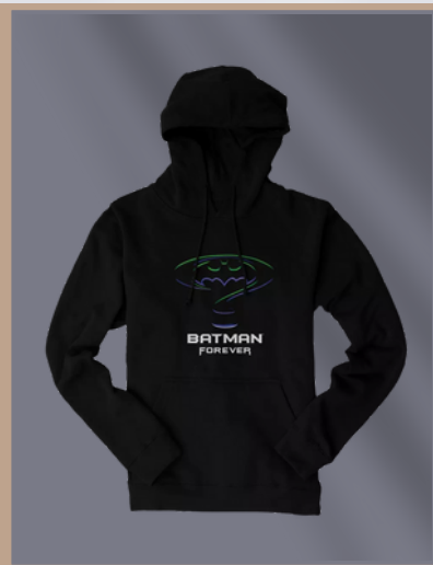
DC Batman Forever Logo Hoodie, Her Universe