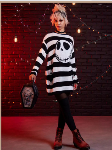
The Nightmare Before Christmas Jack Skellington Sweater Dress, Hot Topic