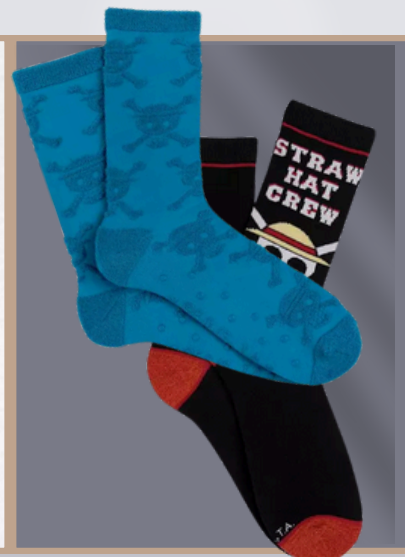
One Piece 2-pair Crew Socks